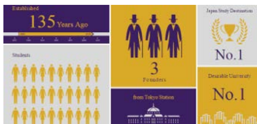
<ALL ABOUT MEIJI ~ Meiji in Numbers>

Furthermore, Meiji University launched "ALL ABOUT MEIJI ~ Meiji in Numbers," a PR website conveying the strengths and specializations of the university through 25 topics in an easy-to-understand fashion. The university is strengthening its provision of information to other countries through public relations in 10 languages, including Japanese.