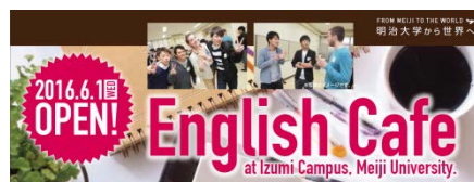
<The English Cafe opening on the Izumi Campus>