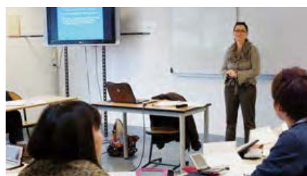
<Study abroad program at Sciences Po Lyon>

Located in Bangkok, Thailand, the Meiji University ASEAN Center provides Japanese language education for students from ASEAN countries before they come to Japan for study, and is engaged in distance education and other activities with Meiji University campuses. In study abroad programs for the ASEAN region, the Meiji University ASEAN Center offers life counseling and support for international students. In addition, it has played a front-line role in crisis management activities, such as confirming the safety of students sent to those countries in times of emergency. The capabilities and functions of the Meiji University ASEAN CENTER will be further developed in the future.