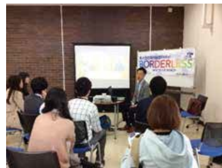
<At the Study Abroad Festa>