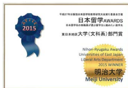
<Ranked 1st for the fourth consecutive year in the Nihon-Ryugaku Awards>

Meiji University will continue to provide cultural exchange spaces in Japan, including the opening of the English Cafe in the International Lounge on the Izumi Campus in the 2016 academic year. It is also promoting use of the student resident supporter system in dormitories whose residents include international students, and developing a new community exchange program.