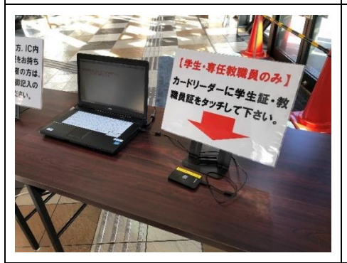
Non-contact thermometer card reader (Surugadai)