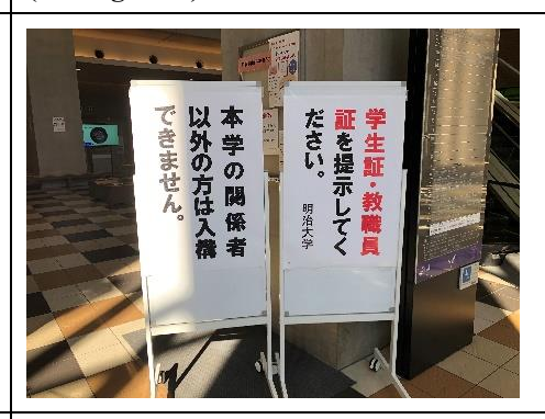
Signboard at the entrance to a building (Surugadai)