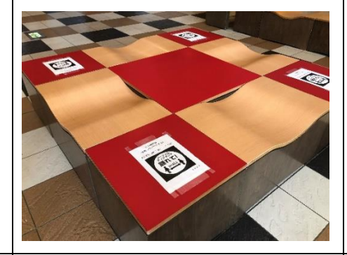
Social Distance Posting (Surugadai)