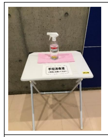
Disinfectant solution (Surugadai)

The following photographs are of some of the measures taken by Meiji university to prevent infection.