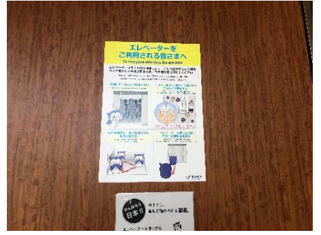
Warning notice in the building (Surugadai)