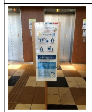
Social distance signboard (Surugadai)