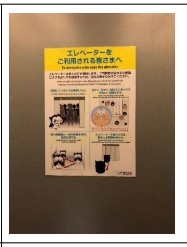
Warning poster in elevator(Surugadai)