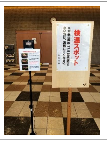
Temperature taking spot (Surugadai)