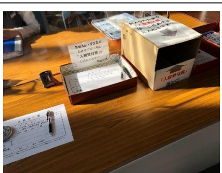
Record of entry to campus (Surugadai)