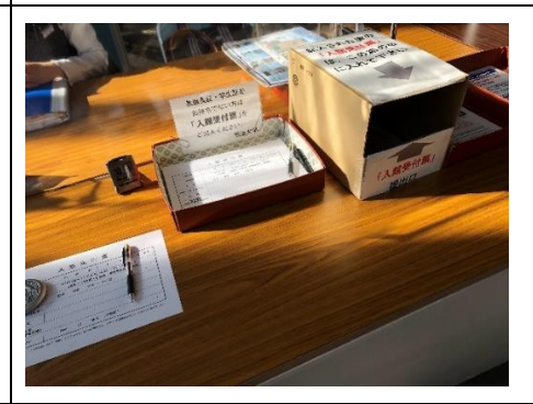
Record of entry to campus