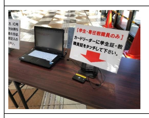
Non-contact thermometer card