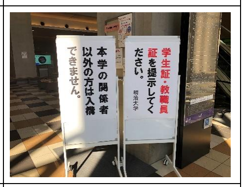
Signboard at the entrance to a