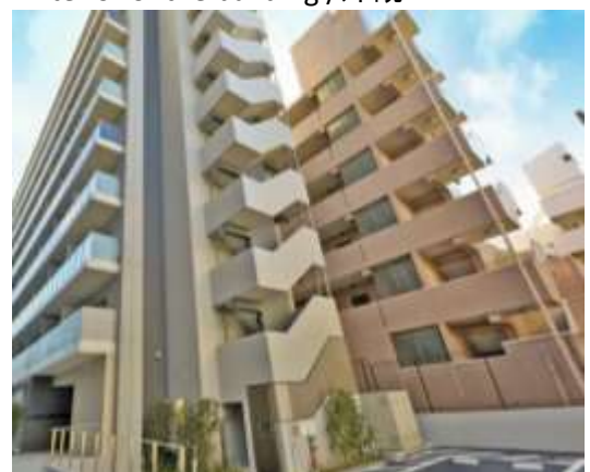
Exterior of the building /外観