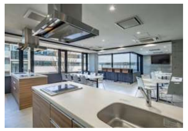
Shared Living / 共有リビング