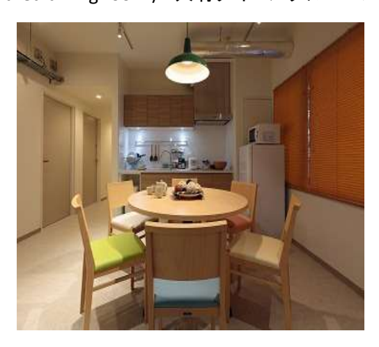
Shared dining room / 共有ダイニングルーム