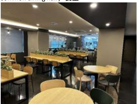
Common dining hall / 食堂