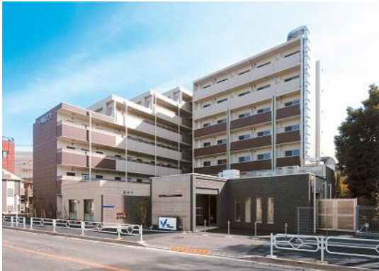
Exterior of the building 外観