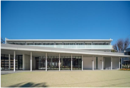
Exterior of the building 外観