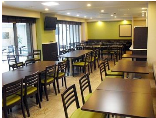
Common dining hall 食堂