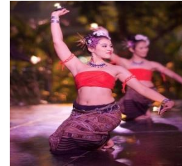
Learning Thai Dancing