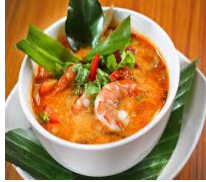
Tom Yum &amp;