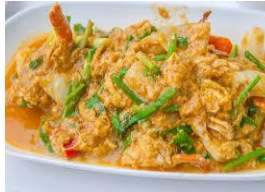
Pad Pong Kra Ree

12:00-13:30pm Eating Lunch with your own cooking food