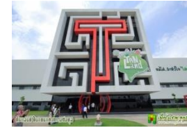
Ayothaya Floating Market