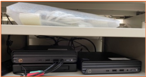
Cables Installed PC PC@LL Device