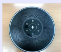
Bluetooth 360° mic.