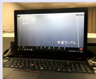
Zoom screen image