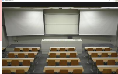
Preset1: Teaching Platform panoramic view