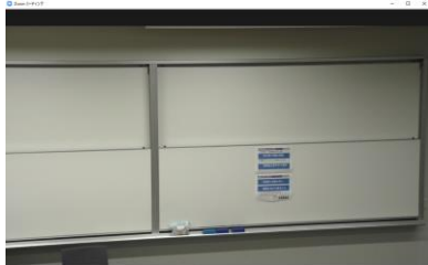
[Preset3: Whiteboard (window side)]