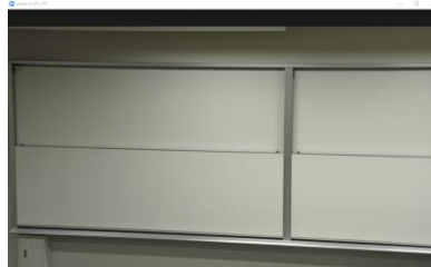
Preset4: Whiteboard (hallway side)