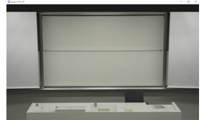
Preset2: Teacher's Desk panoramic view