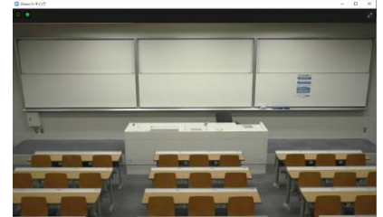
Preset5: Whiteboard panoramic view