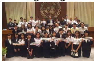
Model United Nations general assembly in Indochina Economic Corridor Excursion Program

Since the adoption of our proposal in 2016, we have been closely consulting with partner institutions about the implementation of student exchange program, and have cleared the target numbers both in inbound and outbound students.