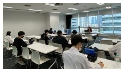
◁ Lecture at the ASEAN Center, Meiji University, Thailand. It was also given in person in Thailand. ▷