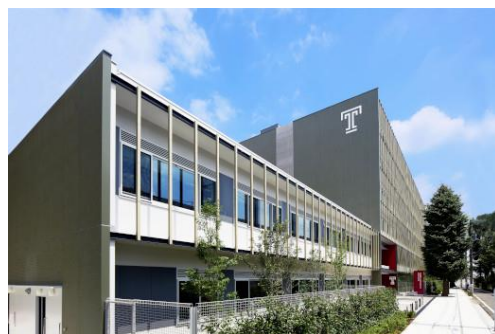
◁ Temple University, Japan Campus (Setagaya-ku, Tokyo) ▷

Meiji University has expanded its credit transfer agreement with Temple University, Japan Campus (Setagaya-ku, Tokyo; "TUJ") to allow students from all 10 departments to send their students to TUJ starting in August 2022. 60% of TUJ students are international students and all classes are taught in English. Meiji University students will be able to have an experience similar to studying abroad without having to leave Tokyo (*applicants must be qualified). The purpose of the expanded agreement is to provide an opportunity for students to have a study abroad experience without having to leave Japan, as some students are hesitant to study abroad due to the spread of the new type of coronavirus. We will continue to develop international education activities that are in tune with the various opinions expressed by students.