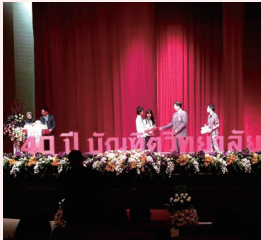
International interdisciplinary symposium in Thailand