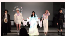
Gender gradation fashion show in MEIJI ALLY WEEK