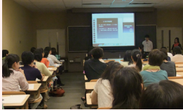
Seminar series: Marriage and female employment in international comparison