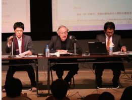
Symposium: Labor and recognition