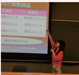
Seminar series: Recovery from anorexia